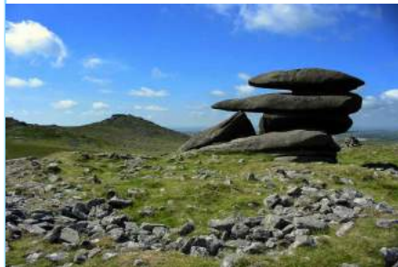
Roughtor, North Cornwall