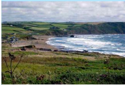
Widemouth Bay near Bude