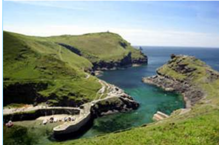
Picturesque Boscastle Harbour